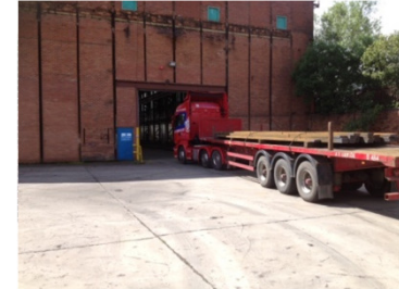
3 BAY NORTH