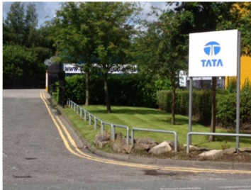
WHESSOE ROAD ENTRANCE