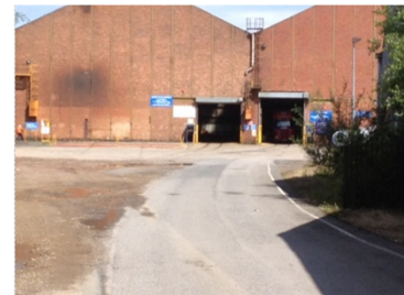
APPROACH TO MILL